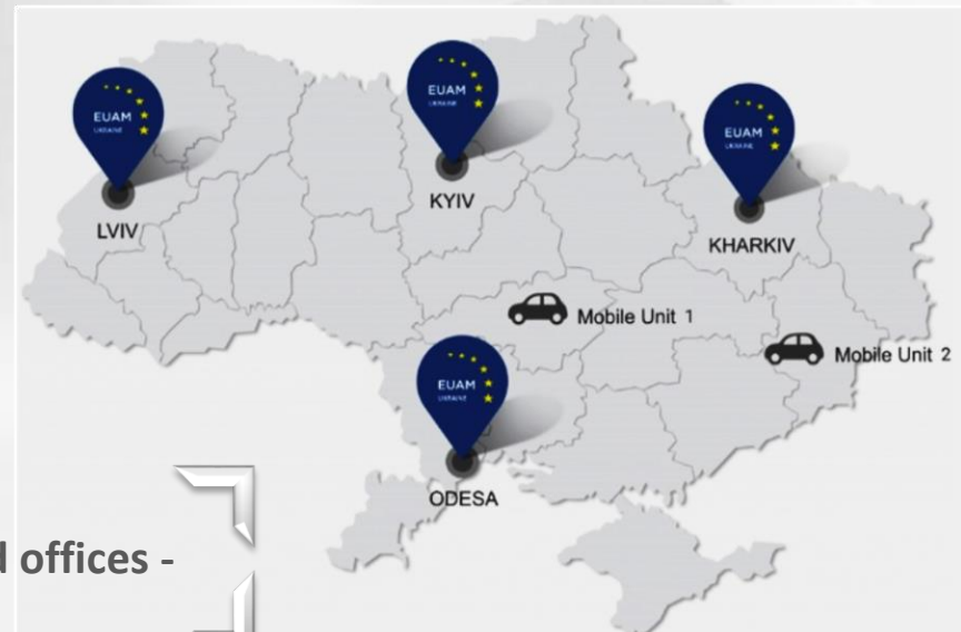
- Field offices -