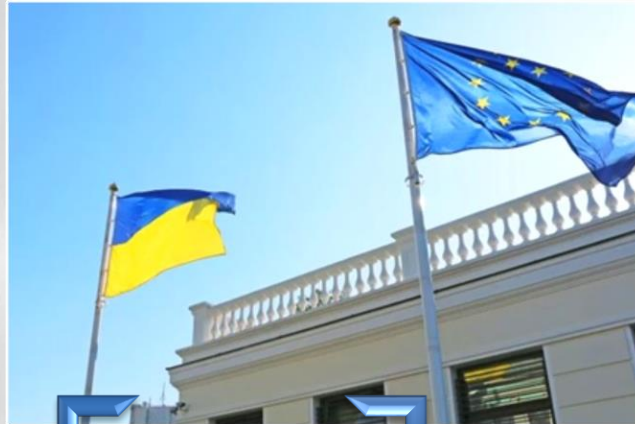
- EUAM HQ -

The European Union Advisory Mission (EUAM) Ukraine is a non-executive mission of the EU (operating since 01 December 2014), which aims to assist the Ukrainian authorities towards a sustainable reform of the civilian security sector through strategic advice and practical support for specific reform measures based on EU standards and international principles of good governance and human rights.