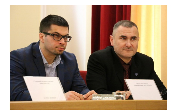
Police and prosecutors in Kyiv look to strengthen criminal investigation procedures